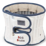
DDS DOUBLE LITE