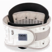
PDAC L0631/L6048 DDS 500