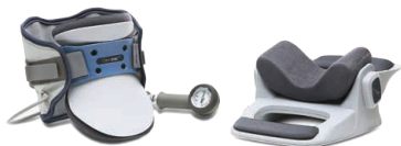
PDAC E0849 Cervitrac™