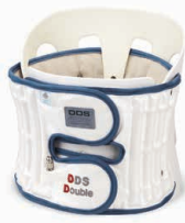
PDAC L0637/L0650 DDS DOUBLE