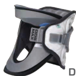
DDS MAX *One size fits most