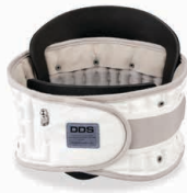
PDAC L0631/L0648 DDS 500