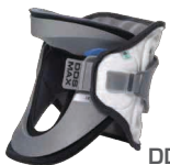
DDS MAX *One size fits most