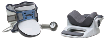
PDAC E0849 Cervitrac™