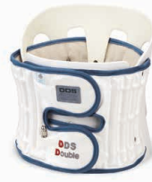
PDAC L0637/L0650 DDS DOUBLE