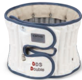
DDS DOUBLE LITE